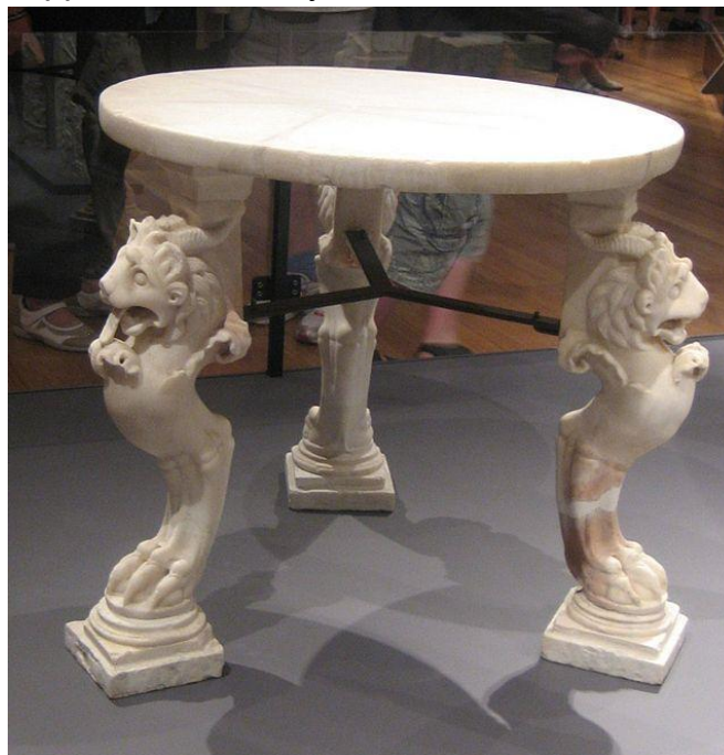
Marble table on trapezophora from ancient Pompeii

F urthermore, throughout history, as the functionality of the table top is to stay flat, the legs of a table have always been the source of inspiration and expression for artists and artisans. Legs were richly carved since the Greeks and Romans but this leg ornament culture has almost disappeared nowadays.