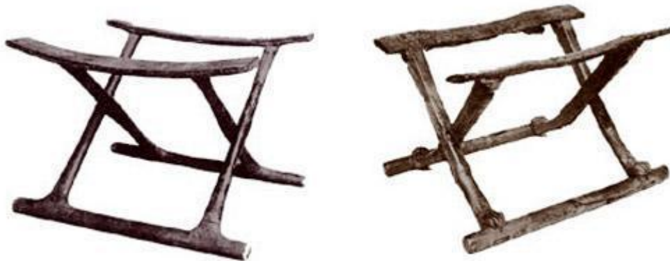
l: folding stool from thebes, c. 1450-1400 B.C. r: folding stool from thebes, c. 1450-1400 B.C.

The history of this particular function of furniture can be traced back to the Egyptian Middle Kingdom (2000-1500 BC). The Egyptians created a wooden folding stool made from two straight interlocking frames with a leather seat. It is said that it was developed as a portable chair for the commanding officer of their army.